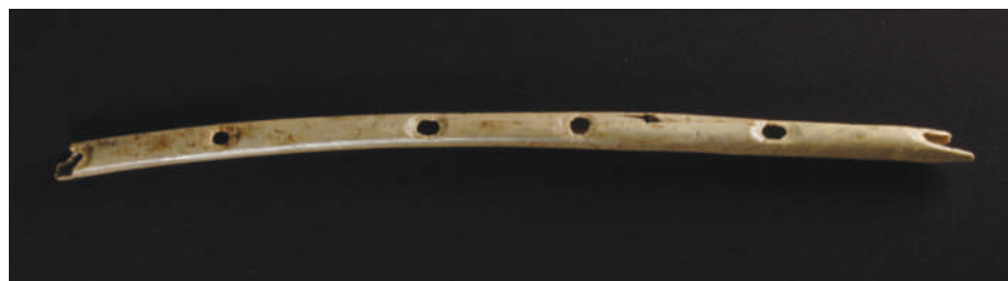
Figure 1 | Sounds old. Conard et al. 1 have discovered the oldest known flute, at Hohle Fels Cave in Germany. The flute is made from bird bone, and dates from the early Aurignacian, 40,000 years ago.

Conard recently reported 2 the discovery of a female figurine carved from mammoth ivory in an Aurignacian layer at Hohle Fels dated to at least 35,000 years ago (based on the newly calibrated radiocarbon timescale). At present, this is the earliest such find in the world. Additional examples of figurative art — of mammoths, horses, bison, cave lions, waterfowl and half-human, half-animal 'therianthropes' — have also been found in Aurignacian layers at Hohle Fels and other sites in the Swabian Jura. These finds suggest that the region was inhabited by a population of Homo sapiens sapiens that had mastered, among other things, the manipulation of mammoth ivory into three-dimensional, naturalistic forms for purposes not directly related to daily economic needs. Just as we continue to do today, these